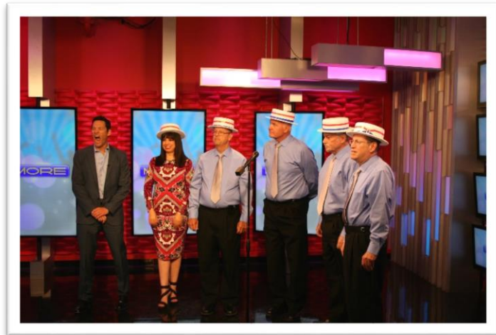
Good Times with the hosts of the TV program