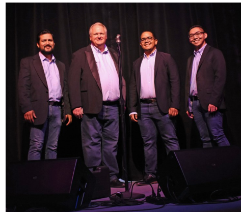
Til Mornin' Comes