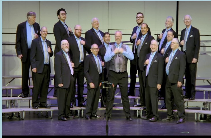
Plateau AA Champions