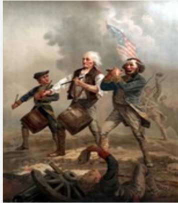
Spirit of '76

So...Who's a Yankee Doodle Dandy? We all are and be proud of it!