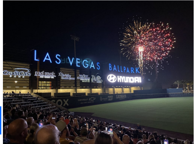
Game Over... Fireworks Start