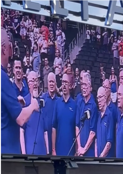
The audience view of us up on the Jumbotron

It's usually one of the largest crowds we get to sing for during the year and fireworks at the end of the game to celebrate Independence Day is a fitting end to a great evening!