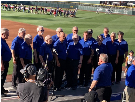
Whether on top of the 3rd base dugout or prominently displayed on the Jumbotron screen, the Silver Statesmen are always a crowd favorite at the Aviators' baseball games.