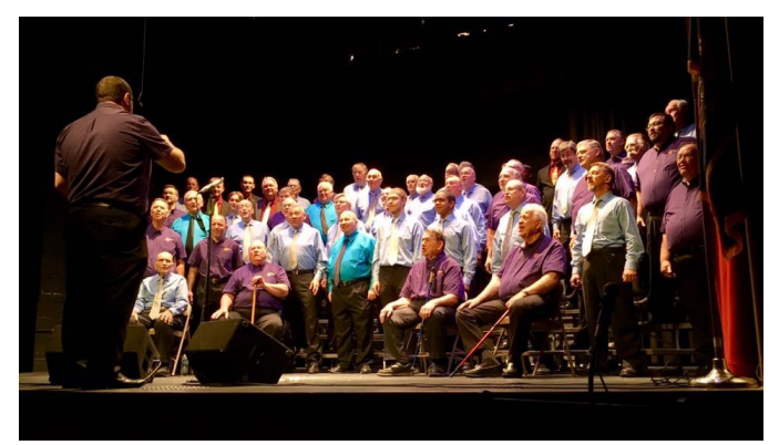
The combined chorus: Stliver Statesmen and Color Country

Brothers and Others Celebrate BARBERSHOP HARMONY September 23, 2017 7pm Electric Theater – St. George, UT