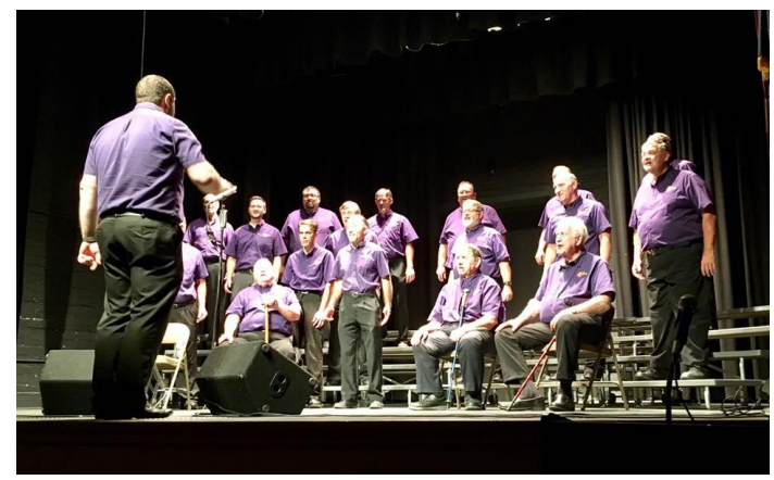
The Color Country Chorus, St. George, Utah