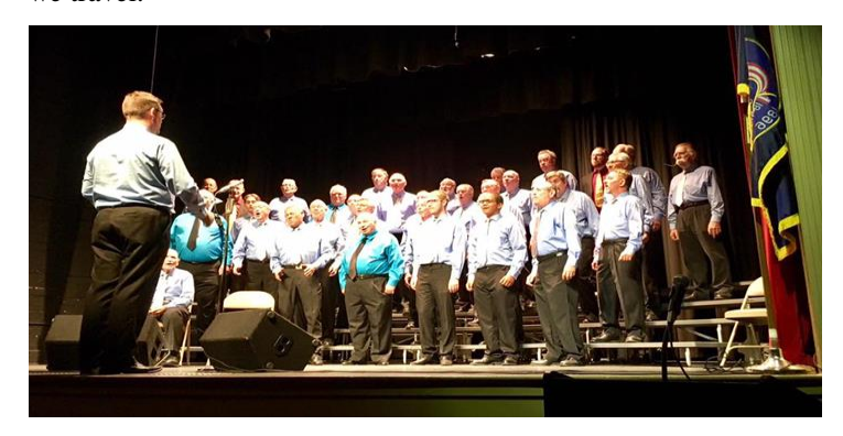
The Silver Statesmen Chorus

We, the Silver Statesmen and Color Country Chorus, may live miles away, but this journey is now filled by the smiles we travel.