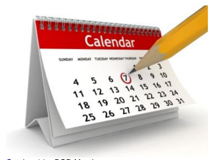
October 14 - BOD Meeting

October 14 - Riser take down - MGM Hotel/Casino